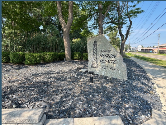
Entrance Clean Up